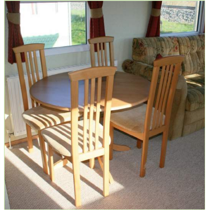
DINING AREA In the corner of the lounge is a round freestanding table with four chairs.