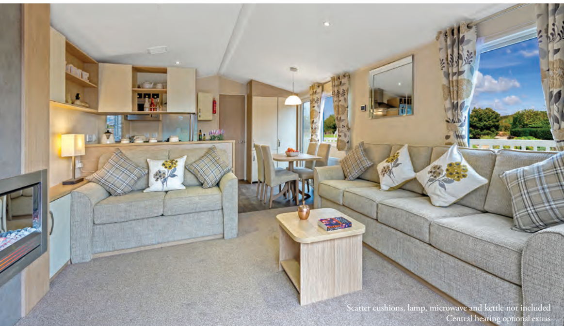
Scatter cushions, lamp, microwave and kettle not included Central heating optional extras