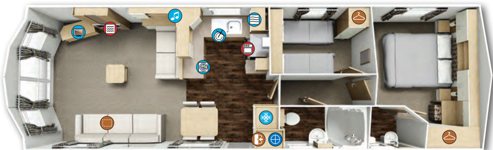
38 x 12 2 bedroom sleeps 6