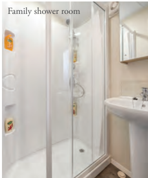
Family shower room