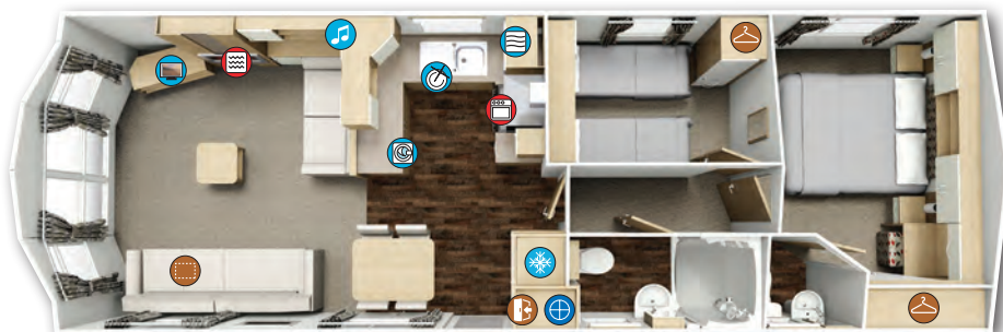
35 x 12 2 bedroom sleeps 6