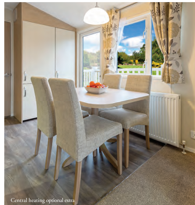
Central heating optional extra