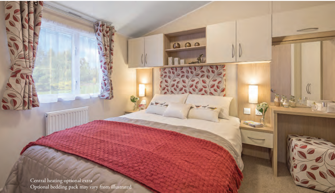
Central heating optional extra Optional bedding pack may vary from illustrated