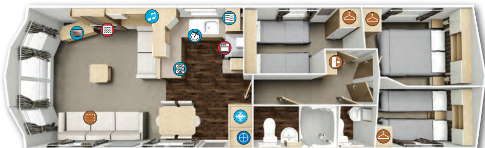
38 x 12 3 bedroom sleeps 8

THERMAX For insulation/window upgrades see page 73