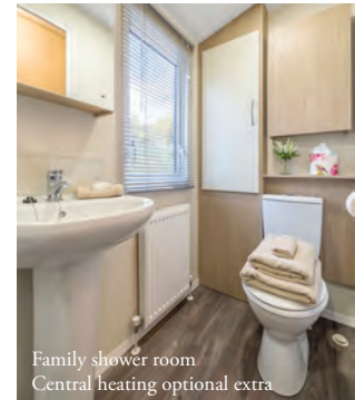
Family shower room Central heating optional extra